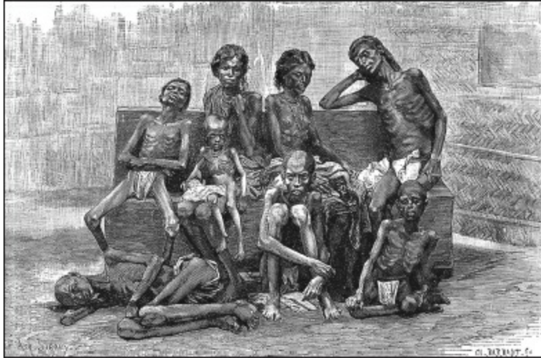
Figure 1.3 A Family in the Deccan, 1877

Conditions were equally desperate across the linguistic and administrative boundary in the Bombay Deccan. Almost two-thirds of the harvest was lost in nine Maharashtran districts affecting 8 million people, with virtually no crop at all in Sholapur and Kaladgi. The disaster befell a peasantry already ground down by exorbitant taxation and extortionate debt. In the Ahmednagar region officials reported that no less than three-fifths of the peasantry was “hopelessly indebted,” while in Sholapur the district officer warned his superiors in May 1875: “I see no reason to doubt the fact stated to me by many apparently trustworthy witnesses and which my own personal observation confirms, that in many cases the assessments are only paid by selling ornaments or cattle.” (As Jairus Banaji comments, “A household without cattle was a household on the verge of extinction.”) Ahmednagar with Poona had been the center of the famous Deccan Riots in May–June 1875, when ryots beat up moneylenders and destroyed debt records. 38