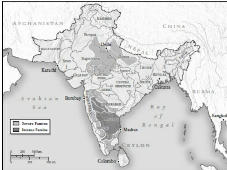
Figure 1.1 India: The Famine of 1876–78