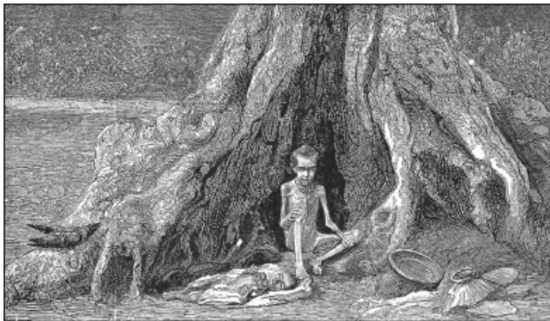
Figure 1.4 “Forsaken!”: An Illustration from Digby’s History

Temple estimated that between January 12 and March 12, 102,000 people discharged themselves from Government employ. He thought he traced in their proceedings a sign of “some method and system.” They imagined, by suddenly throwing themselves out of employ they virtually offered a passive resistance to the orders of Government. They counted on exciting the compassion of the authorities and still more on arousing fears lest some accidents to human life should occur. They wandered about in bands and crowds seeking for sympathy. 67