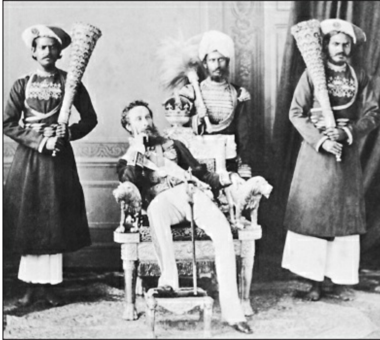
Figure 1.2 The Poet as Viceroy: Lytton in Calcutta, 1877

Following this triumph, the viceroy seemed to regard the growing famine as a tiresome distraction from the Great Game of preempting Russia in Central Asia by fomenting war with the blameless Sher Ali, the Emir of Afghanistan. Lytton, according to Salisbury, was “burning with anxiety to distinguish himself in a great war.” 15 Serendipitously for him, the Czar was on a collision course with Turkey in the Balkans, and Disraeli and Salisbury were eager to show the Union Jack on the Khyber Pass. Lytton’s warrant, as he was constantly reminded by his chief budgetary adviser, Sir John Strachey, was to ensure that Indian, not English, taxpayers paid the costs of what radical critics later denounced as “a war of deliberately planned aggression.” The depreciation of the rupee made strict parsimony in the nonmilitary budget even more urgent. 16