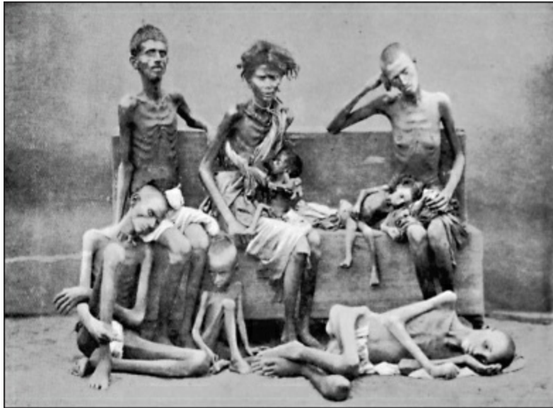
Figure 1.6 Famine Victims, 1877